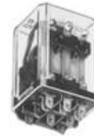
General Purpose Relay

General Purpose Relay: The general-purpose relay is rated by the amount of current its switch contacts can handle. Most versions of the general-purpose relay have one to eight poles and can be single or double throw. These are found in computers, copy machines, and other consumer electronic equipment and appliances.