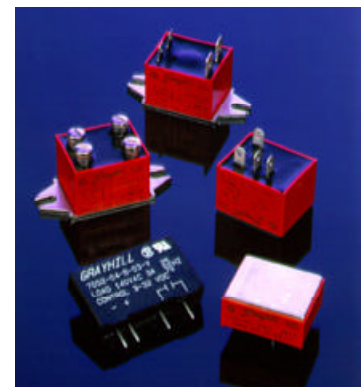
Solid State Relays

These active semiconductor devices use light instead of magnetism to actuate a switch. The light comes from an LED, or light emitting diode. When control power is applied to the device’s output, the light